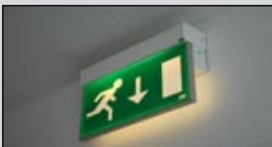
Measuring the emergency lighting in emergency exits